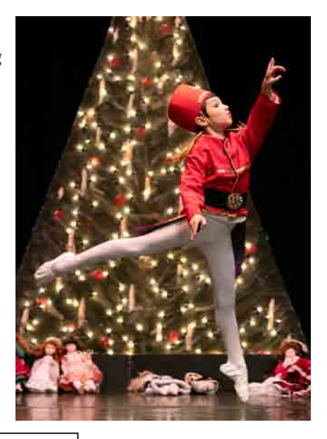
Level V dancer as the Nutcracker (Photo: Beth Phillips).

PBS offers ballet for adults to enrich the lives and keep them in touch with their bodies. Two levels of ballet are offered. Furthermore, serious adults are also encouraged to take regular classes in the level and perform with PBS students in The Nutcracker and the spring performance.