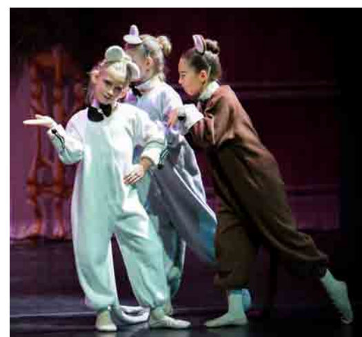
Ballet II dancers in The Nutcracker (Photo: Sandee Arehart).

Check sections. They describe some of the skills your child should be learning year by year; if you're not seeing those results from your current school, it may be time to switch to PBS.