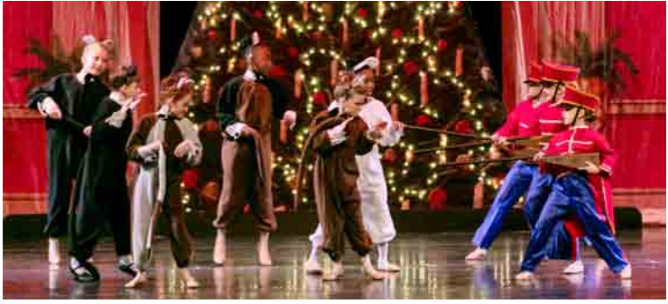
Level II & III dancers in The Nutcracker (Photo: Beth Phillips).